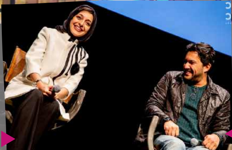
Actress Sareh Bayat, Winner of the Best Actress Prize at Berlinale for Separation