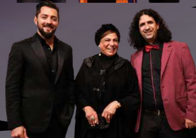
Actor Bahram Radan