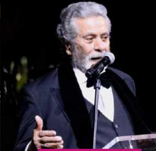
Actor Behruz Vosoughi