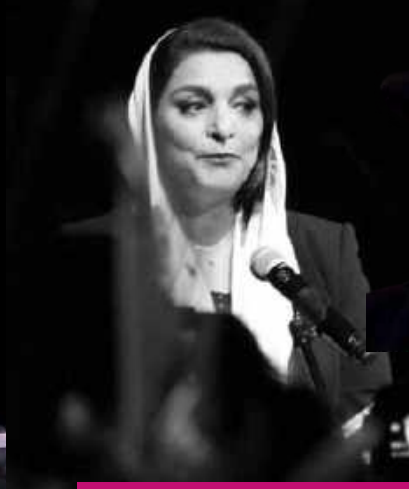
Director Tahmineh Milani