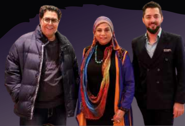
Actress Gohar Kheirandish